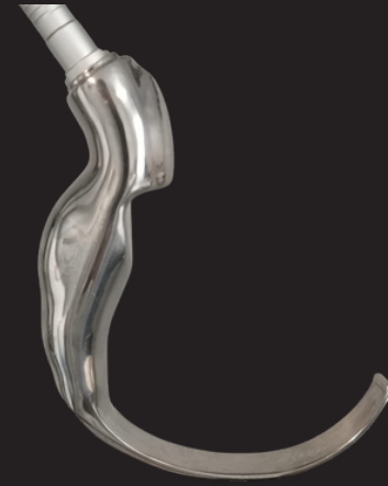
ADVANCE ADULT (ADULT DIFFICULT AIRWAY)