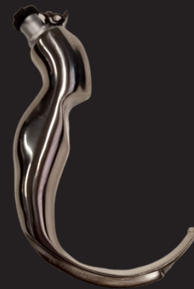
ADVANCE PEDIATRIC (PEDIATRIC DIFFICULT AIRWAY)