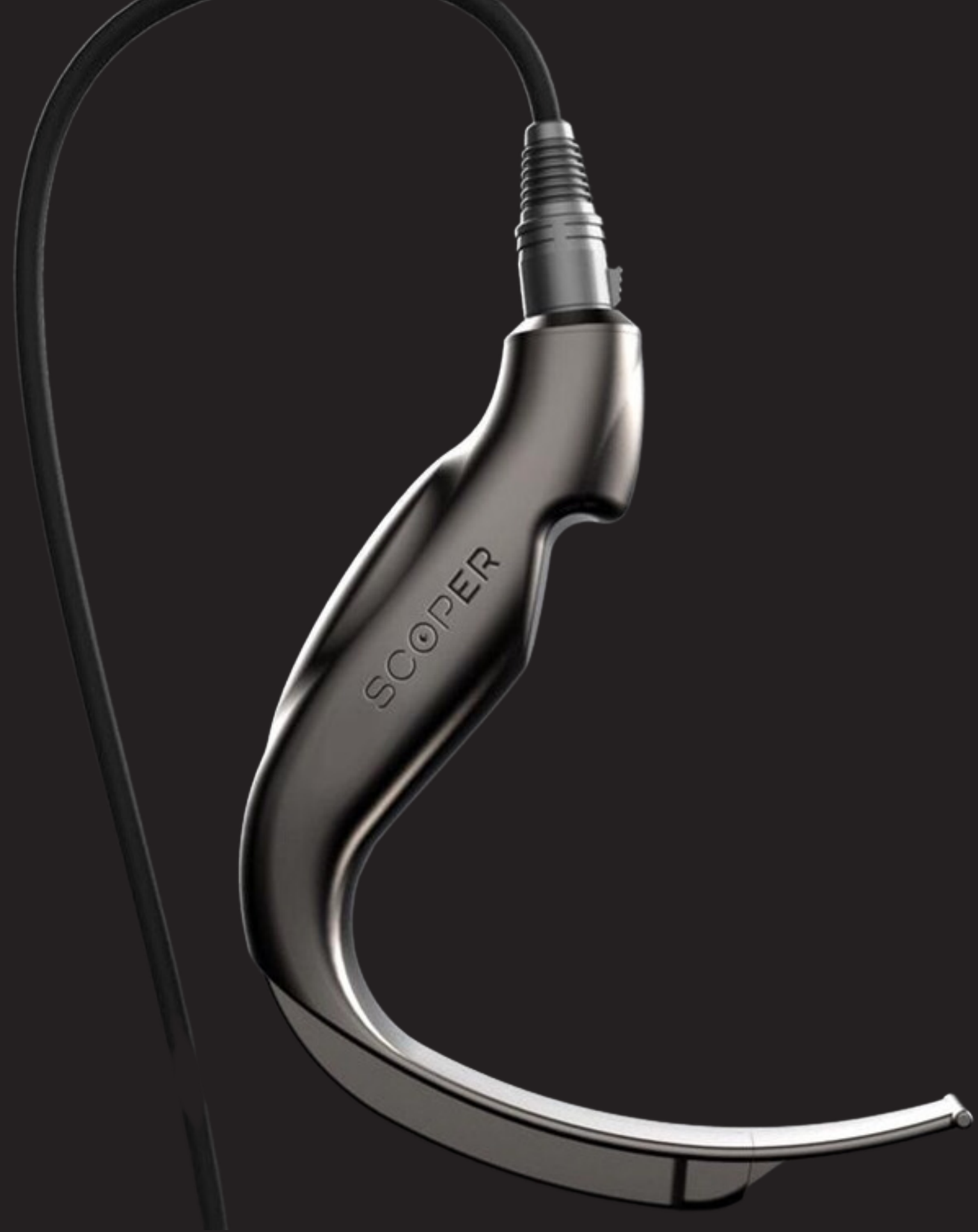
Video Laryngoscopy Device